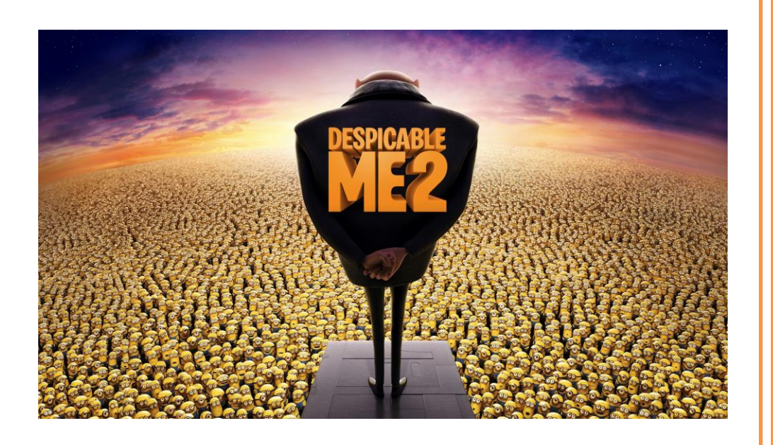
Movie Worksheet Was/Were